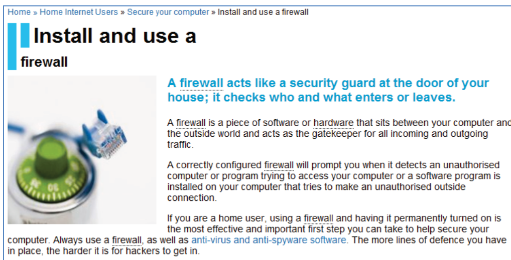
Figure 4 StaySmartOnline - Installing a firewall

In contrast it is worth examining an information portal external to Australia, and this paper considers the relative worth of Get Safe Online (GetSafeOnline, 2011). In this instance, the information portal is a collaborative project amongst numerous computer security vendors, law enforcement, and Government agencies. Although external to Australia, it still suffers from the same issues as the StaySmartOnline and CyberSmart project. As demonstrated through Figure 3, the screen snap shot purports to explain the function of a firewall, together with installation and configuration information. In this instance, the StaySmartOnline portal falls short of its advertised and promoted intentions. The site ignores the need to provide step-by-step procedures into how to obtain, install and configure a personal firewall to be used effectively in a home or small business environment.