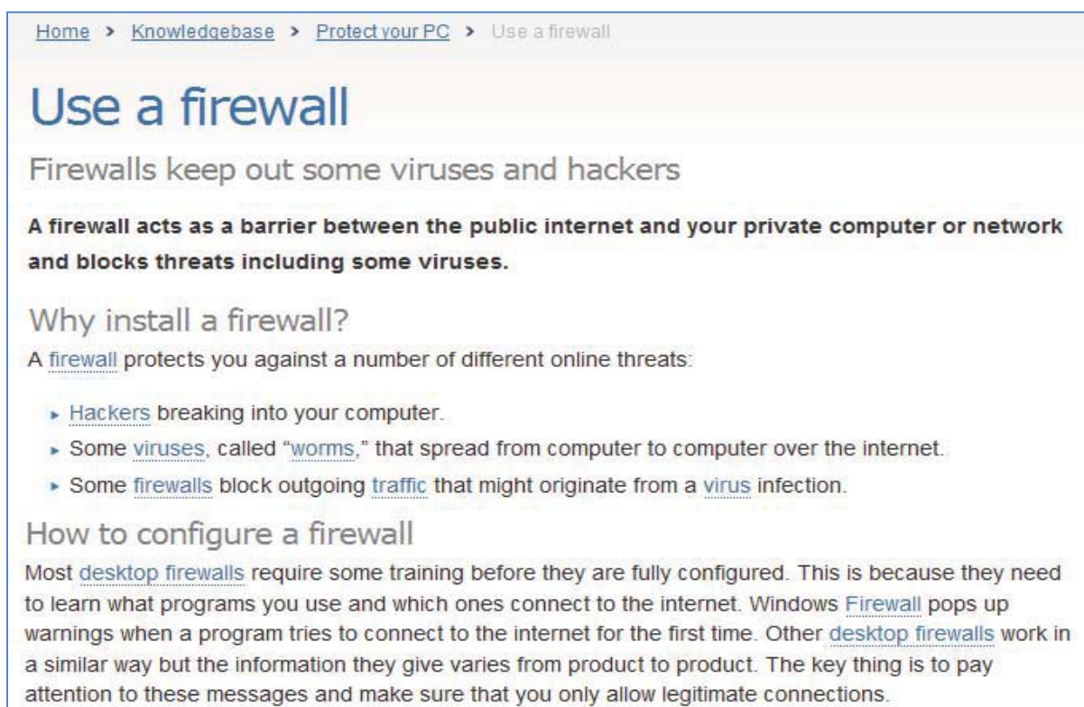
Figure 3 Get Safe Online - Using a firewall