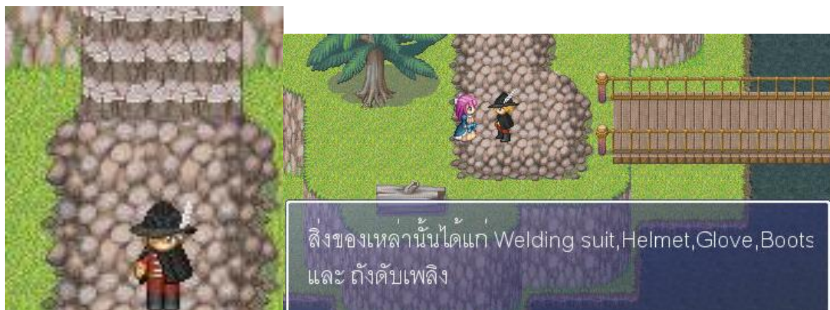
Figure 2: The X- mission's young knight

Within this course, we provided participants with the opportunity to use a game-based virtual reality module called The X-mission. The game was created by one of the authors of this paper. The game aims to facilitate learning safety in the welding lab. It also aims to improve the students' self-learning, problem-solving, and information technology skills. In the game, students have an avatar as a young knight (see Figure 2).