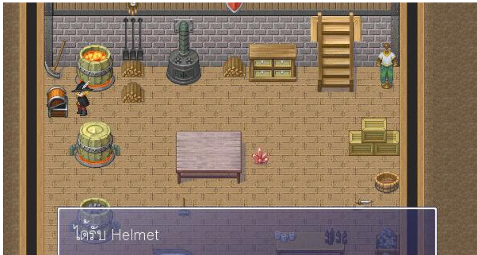
Figure 3: Computer's avatar