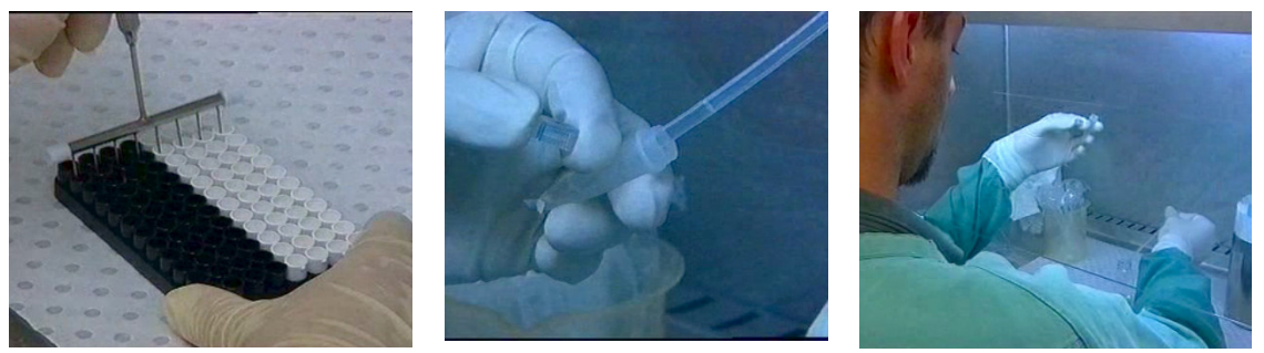
Figure 8. Images from "Hepatitis C Increasing to Epidemic Proportions": Laboratory technicians at work

Proportions" Dr Roberts and Morgan have considerably more screen time and more dialogue than does Meade. Footage of technicians at work in the laboratory is used as background as the journalist tells viewers of the work of researchers to "refine" drugs, and Dr Roberts informs them of studies to gauge improvements in treatment regimes (see Figure 8). Such images reinforce the status of medical research, something that viewers can believe in. Medical research is literally portrayed as ongoing, behind-the-scenes and continually improving upon its achievements.