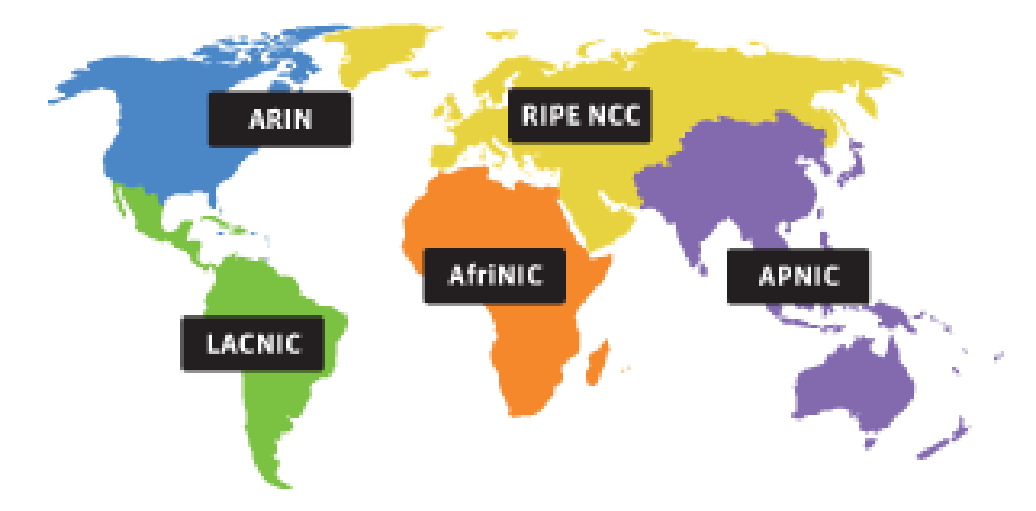
Figure 17 - World map highlighting the geographical coverage of each RIR (Internet Assigned Numbers Authority, n.d.)

The IANA dictates which IPv6 block or range each RIR is allocated (Hinden & Deering, 2006; IANA, 2008), with most RIRs distributing their ranges directly to LIRs, who in turn service end users (and potentially other ISPs). A notable exception to this policy is APNIC whose realm covers the entire Asia/Pacific region. Consequently, APNIC assigns ranges to NIRs for further distribution to LIRs.