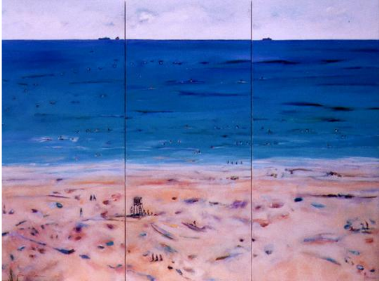
Plate 6. Port Beach Triptych (Angela Rossen, 2000)