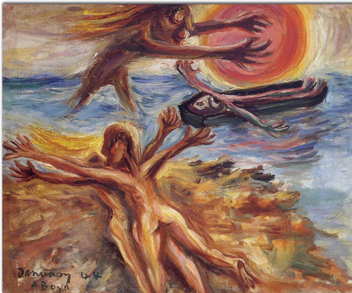
Plate 3. The Beach (Arthur Boyd, 1944)

Edith Cowan University School of Communications and Arts Centre for Research in Entertainment, Arts, Technology, Education & Communications The International Centre for Landscape and Language Landscapes ISSN 1448-0778