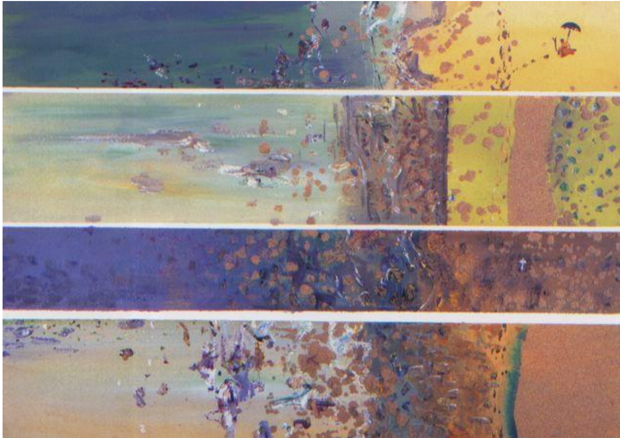
Plate 7. Beachscape, Erith Island 1 (Fred Williams, 1974)

Edith Cowan University School of Communications and Arts Centre for Research in Entertainment, Arts, Technology, Education & Communications The International Centre for Landscape and Language Landscapes ISSN 1448-0778