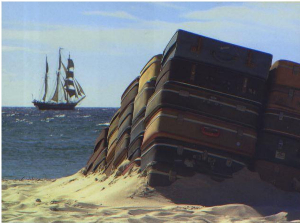
Plate 1. Transpose (Nien Schwarz, 2005)