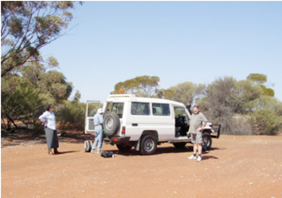
Troops on the road

Once our 4WD "Troop Carrier" was delivered by Thrifty Rentals next morning, the group was underway and heading north on the Goldfields Highway towards Leonora.