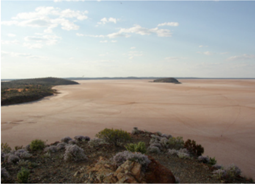
General view of Lake Ballard and sculptures

Cameras were clicking and whirring as the ICLL party spread out to see as many of the individual figures as possible in the afternoon. Several were sketching and painting and others collected specimens for future study. Bird life is prolific, especially in the groves of mulga and mallee on the dune shores of the lake. But it was a dry lake, just 'tacky' to the walkers and so no waterbirds were to be seen.