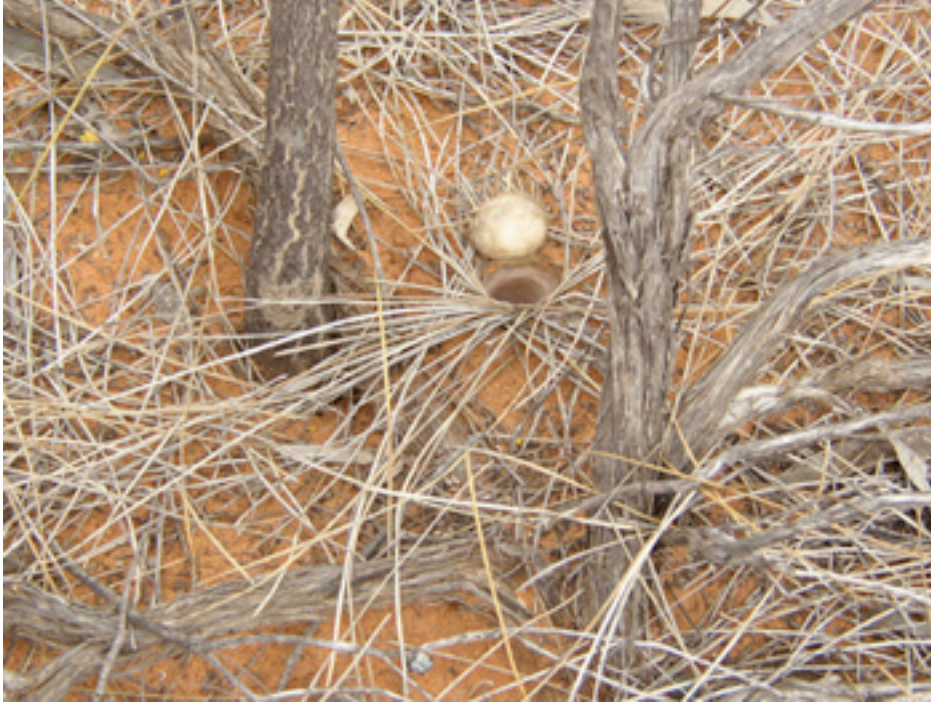
The door to the spiders trap

Menzies was reached by midday and luggage deposited in our rooms at the local hotel. Cut lunches were ordered immediately and a barbecue dinner arranged for the evening by the obliging hotel proprietor.