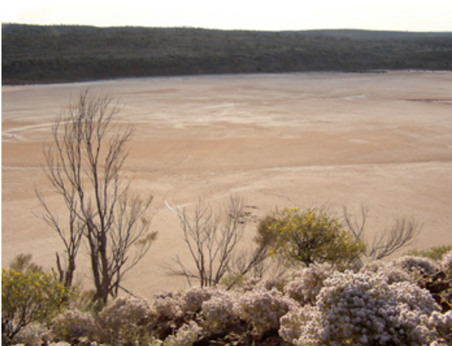
Dawn light on Lake Ballard

Early risers at 4am, well before the earliest breakfasters, hastened to load up the 4WD for a second lake visit for dawn photography. This proved even more spectacular with the eastern light discovering new facets of the lake and the sculptures. On the return run to breakfast at the hotel, more wildlife was noticed on the road and several strategic stops discovered further colonies of trapdoor spiders and an amazing range of spring flowering plants and trees. Bird life, including budgerigars, galahs, spinifex parrots, top-knot pigeons, eagles and crows, was plentiful.