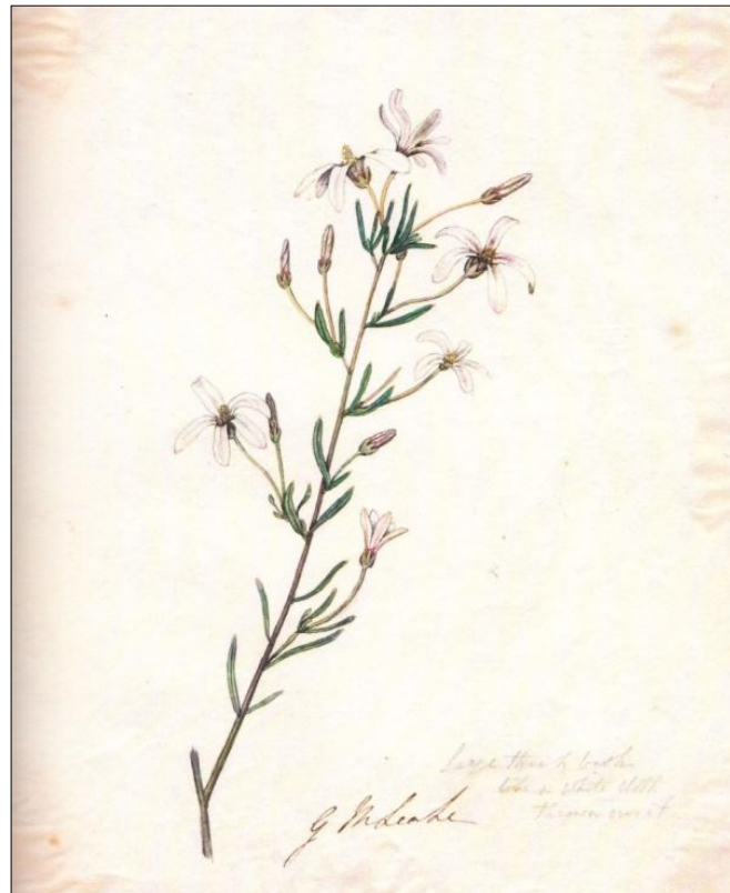
Figure 3. Plate XVIII of Georgiana Leake's Wildflower Album picturing Cape Weed.