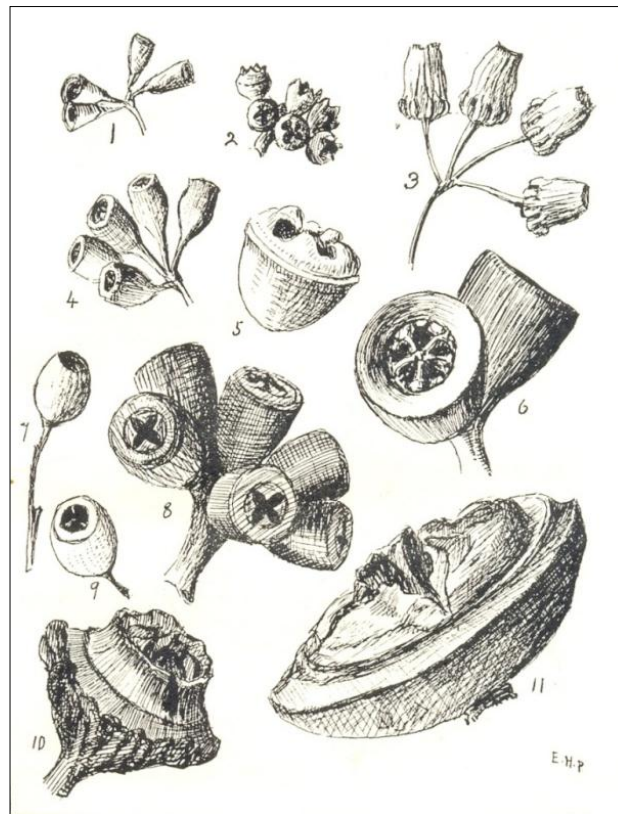
Figure 5. Sketch of eleven different gum nuts from Emily Pelloe’s Wildflowers of Western Australia .