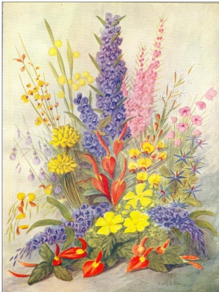
Figure 6. Plate from Emily Pelloe's Wildflowers of Western Australia with sixteen species depicted.