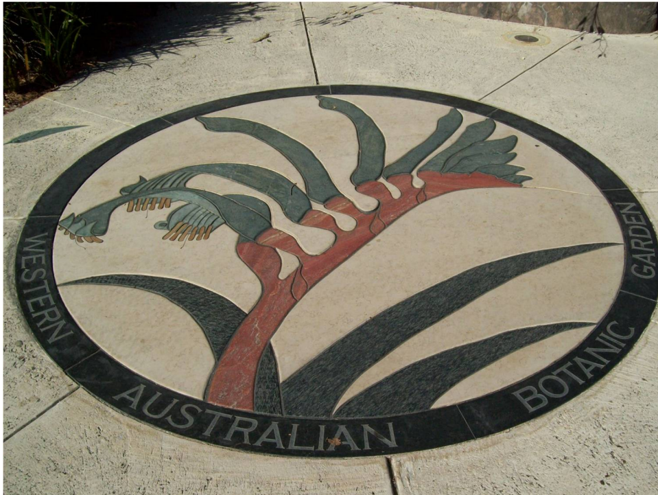
Figure 5: Kangaroo Paw Installation at Kings Park and Botanic Garden

from Swan River by Sir James Stirling, the enterprising governor of that colony, by whom they had been presented to Mr. Mangles' (Don, 1835: 265).