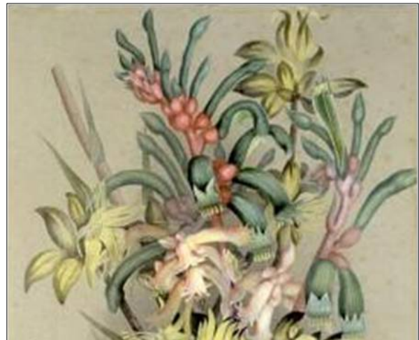
Figure 4: Catspaw by Marian Ellis Rowan (1880, watercolour and gouache on paper)