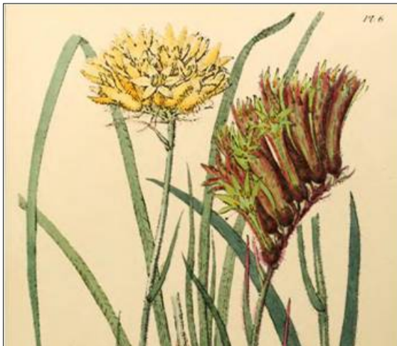
Figure 3: Catspaw Featured on Right By Artist Unknown (from John Lindley's A Sketch of the Vegetation , 1840)

In order to demonstrate the kinds of data that will be featured in the FloraCultures web archive, I will briefly sketch the plant-based cultural heritage of the catspaws ( Anigozanthos humilis ) and kangaroo paws ( Anigozanthos manglesii ) using the combined tangible and