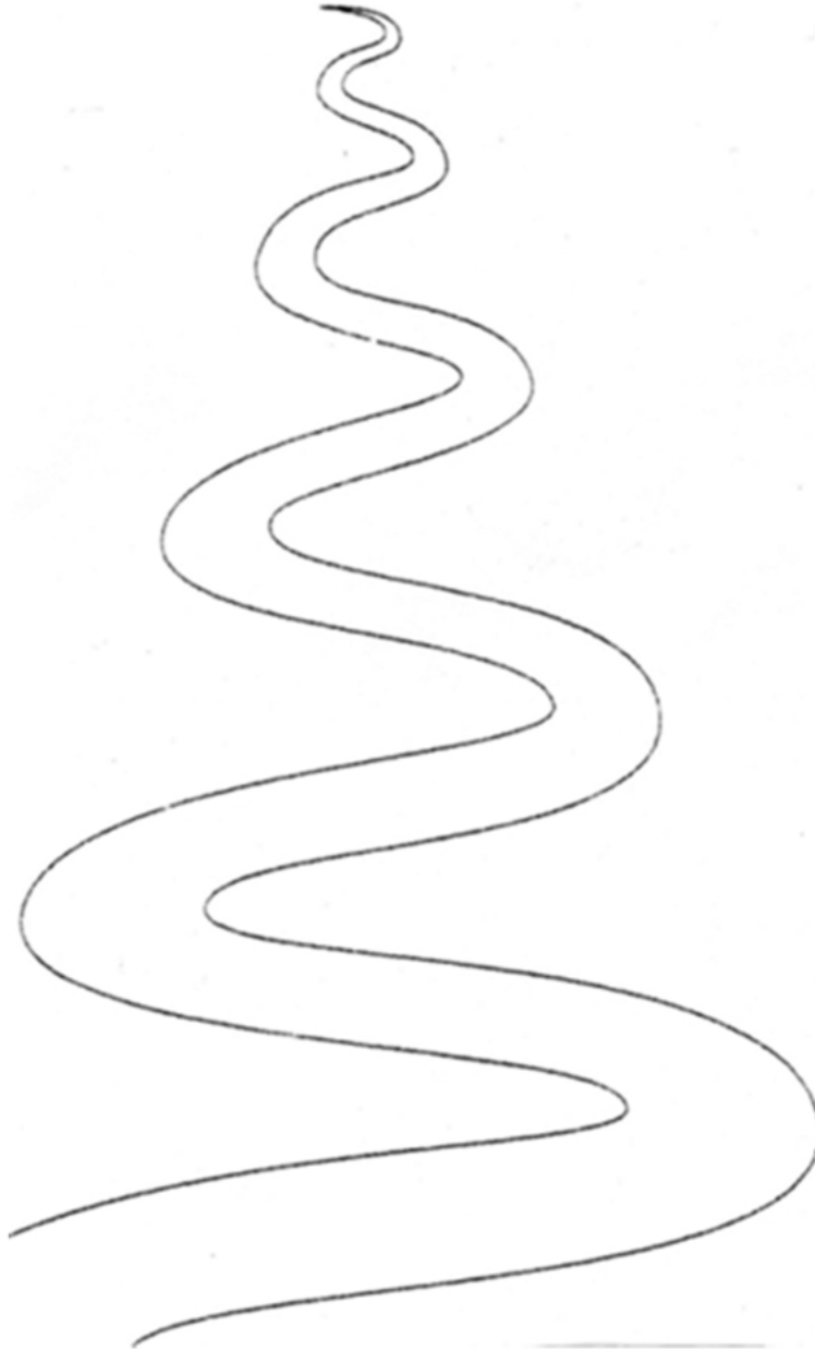
Figure 2: Creative River Journey (for data capture in interviewing)