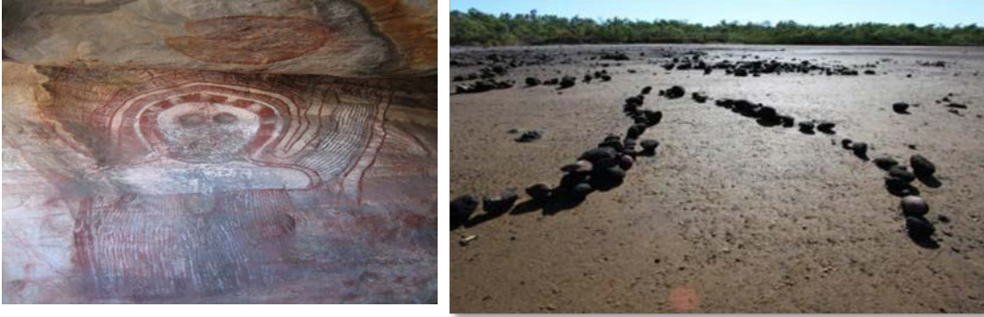
Figure 1: Symbolic representations of (a) Wanjina and (b) Wunguur Creator beings. Published with Traditional Owner permission.