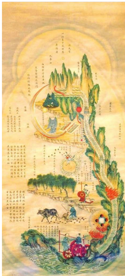
Fig. 1.1: Neijing tu (Ming-shun shu-chu, 1967)

In Taoism, the human body is not separate from the earth: it is interconnected and considered to be one entity (Giblett, 2008b; Kohn, 2006; Schipper, 1978). This Taoist perspective, which views the human body, mind and the earth's landscape as one, is represented by a nineteenth century image known as the Neijing tu (Callicott & McRae, 2015, p. 237).