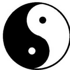
Fig. 0.1: Taoist Yin and Yang symbol (Kohn, 2006)

Taoism is an ancient Chinese philosophical practice that encourages people to live in unison with nature and follow the Taoist ‘Way’. The Taoist Way encourages spontaneity, naturalness, action through non-action (wu wei), and human-heartedness over human constructs, such as fixed perceptions of reality and codes of conduct created by society as a whole (Miller, 2008; Watts, 2011; Robinet, 1997). A core Taoist concept known as yin and yang—represented by a symbol, which depicts the entwinement of black and white in equal proportions within a sphere—expresses the interconnected relationship of all things within the universe (Robinet, 1997, p. 7).