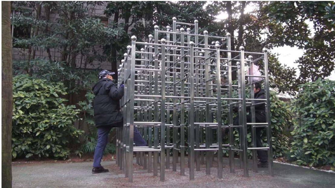
Fig 2.1: People perform repetitive exercises on a lifeless machine-like structure

There are many scenes in Shanghai Parklife that express Rod Giblett’s (2008b) theories, which contrast the machine body of Western medicine (p. 19) and the Taoist body of the earth (p. 157). These examples suggest that although many of Shanghai’s inhabitants’ core beliefs stem from Taoist philosophies (Palmer & Liu, 2012, p. 48) that speak of the interconnected relationship between humans and the earth (Girardot, Miller, & Liu, 2001), ‘the Maoist body’ of the West and ‘the Taoist body’ of the East are still at war (as cited in Giblett, 2008b, p.10).