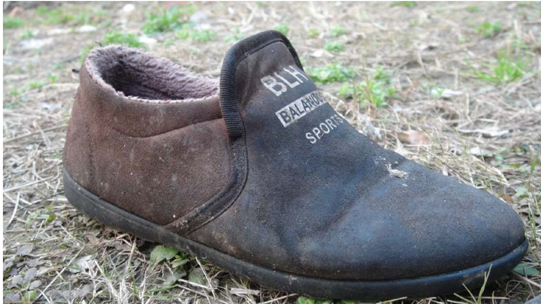
Fig. 2.15: Image of shoe, sound of footsteps

meditation that occurs as a result of the association between the image and sound we hear might be more complex and interpretive, such as the tension that mounts on a mysterious hook as a bag on wheels departs (Figure 2.16) or a unidentifiable sound which resembles Snow White ruffling her dress (Figure 2.17).