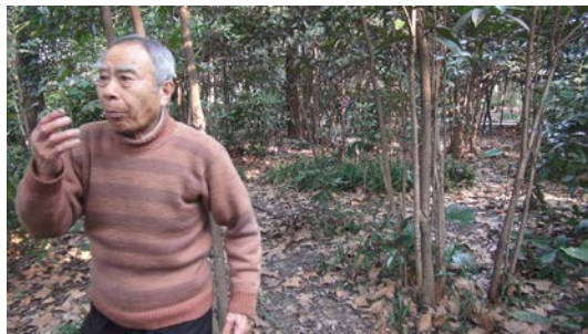
Fig. 3.12: Old man breaks the camera frame

There are several places in Shanghainese Parklife , where I considered it appropriate and necessary to draw attention to the constructed nature of the documentary.