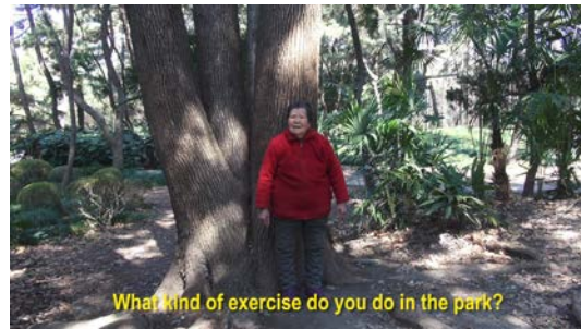
Fig. 3.13: Interviewer's question included

In Figure 3.12 the old man being interviewed does not hear the question, and momentarily abandons his position in front of the camera to move closer to the interviewer. In doing so, the old man no longer directly addresses the viewer, but instead breaks the camera frame, and draws attention to the contrived nature of filmmaking and its technical limitations. This footage was not only included for comic purposes. By including this spontaneous 'mistake', I desired the viewer to gain an insight into the personality of the invisible interviewer.