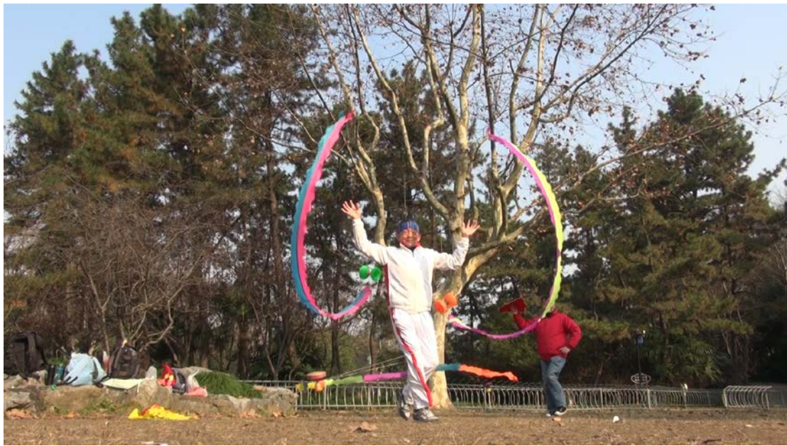
Fig. 2.7: Diabolo master embodies 'the Way' or the Tao

Tao. Wiseman's decision to exclusively use the observational mode in Central Park (1989) creates a sense of realism and authenticity, which is vastly different from Nichols' (2010) other modes, such as the reflexive (p. 194) and performative modes (p. 199). While these modes draw attention to the constructed nature of the film (p. 194) or the conscious performances of the documentary's participants (p. 199), the observational mode in Central Park gives the viewer the impression that they have just witnessed a moment that has been in no way manipulated by the filmmaker.