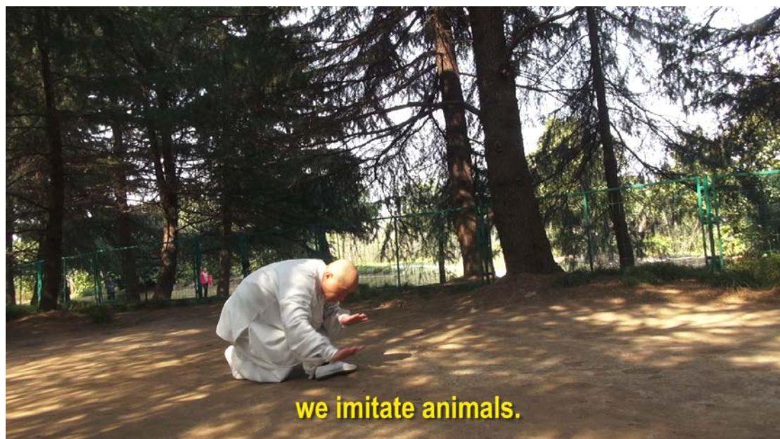
Fig. 2.5: Kung fu master performs the movements of a dragon

Giblett (2008b) suggests that Leonardo da Vinci (1452-1519) saw the human body as "a sort of microcosm of both the machine and the earth, and the earth the macrocosm of the human body" (p. 20). While I chose to show many people in Shanghai Parklife , who exhibit the desire to embrace nature and mimic the movements of animals (Figure 2.5), Yuan Xingboa and the other whip crack masters are intended to provide a contrast to the idealized Taoist body of the earth. While the man holding the tree in Figure 2.3 is rooted to the earth, and the Kung fu master in Figure 2.5 performs the movements of a dragon, Yuan Xingboa (Figure 2.6) appears to be at war with nature as his body becomes one with a machine.