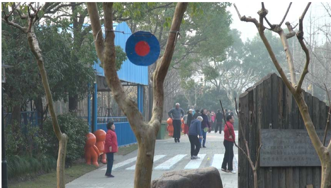
Fig. 2.10: People perform vigorous exercise to music reminiscent of China’s Cultural Revolution

One of the many reoccurring sounds I encountered in the parks of Shanghai was the sound of propagandistic music of a contradictory nature. In Figure 2.10 the sound of music reminiscent of China’s Cultural Revolution blasts from the park’s loudspeaker, while in Figure 2.11 the soft tones of a flute and a birdlike voice waft and chirp amongst the leaves of a camphor tree.