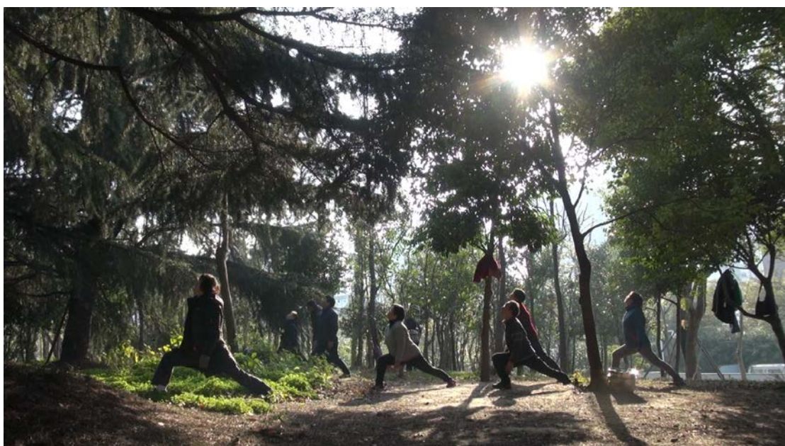
Fig. 2.4: People performing a body cultivation practice mimic the movement of a crane

Influenced by Giblett's (2008b) theories concerning the Taoist body of the earth (p. 157) and the concept of the Nejing Tu (Figure 1.1): the lines on the man's tracksuit pants mirror the lines on the tree trunk (Figure 2.3). This opening shot which introduces the viewer to the documentary's subject matter of cultivating the Taoist body was used to provide a visual representation of the core Taoist belief that the human body and the earth are one entity (Giblett, 2008b; Kohn, 2006; Schipper, 1978)