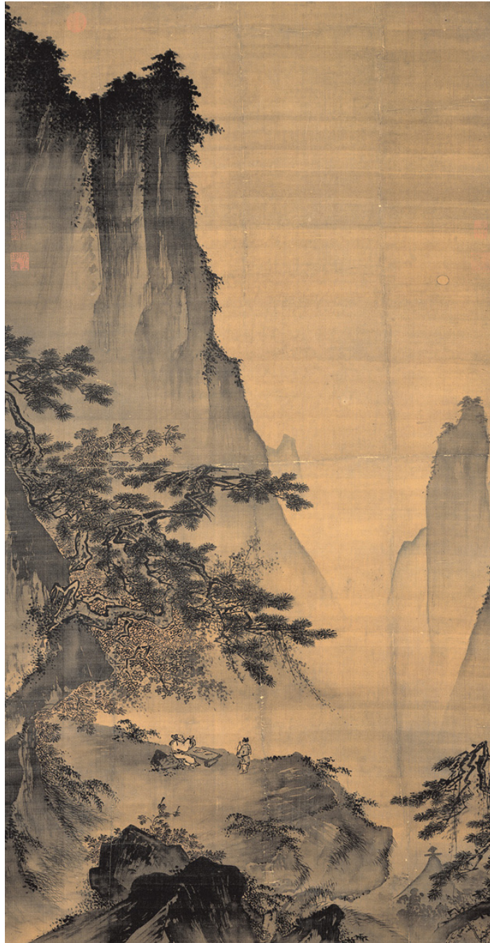
Fig. 2.14: Ma Yuan (ca 1500) Poet drinking by moonlight (Tang Dynasty)

As I did not wish to create an interpretive piece of music with standard instruments to accompany the images in Clouds and 4 cigarettes , I instead adopted Eno's approach of using the landscape as an instrument (Toop, 1995, p. 132). In a similar fashion to the way in which John Cage used the limbs of plants as instruments in Child of Tree (1975) and Branches (1976) (Kostelanetz, 2004, p. 92), my cigarette lighter and a chocolate bar wrapper became instruments within the ambient soundscape.