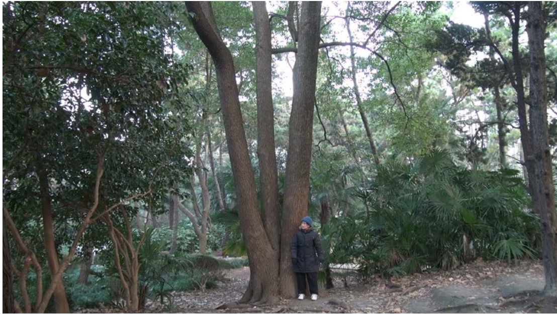
Fig. 2.11: Old woman knocks on a camphor tree as meditative music plays

When piecing together the final poetic montage in Shanghai Parklife , I decided to extend the soundscape I recorded while filming the old woman knocking a camphor tree, by using Eno's method of looping sounds (Toop, 1995, p. 132).