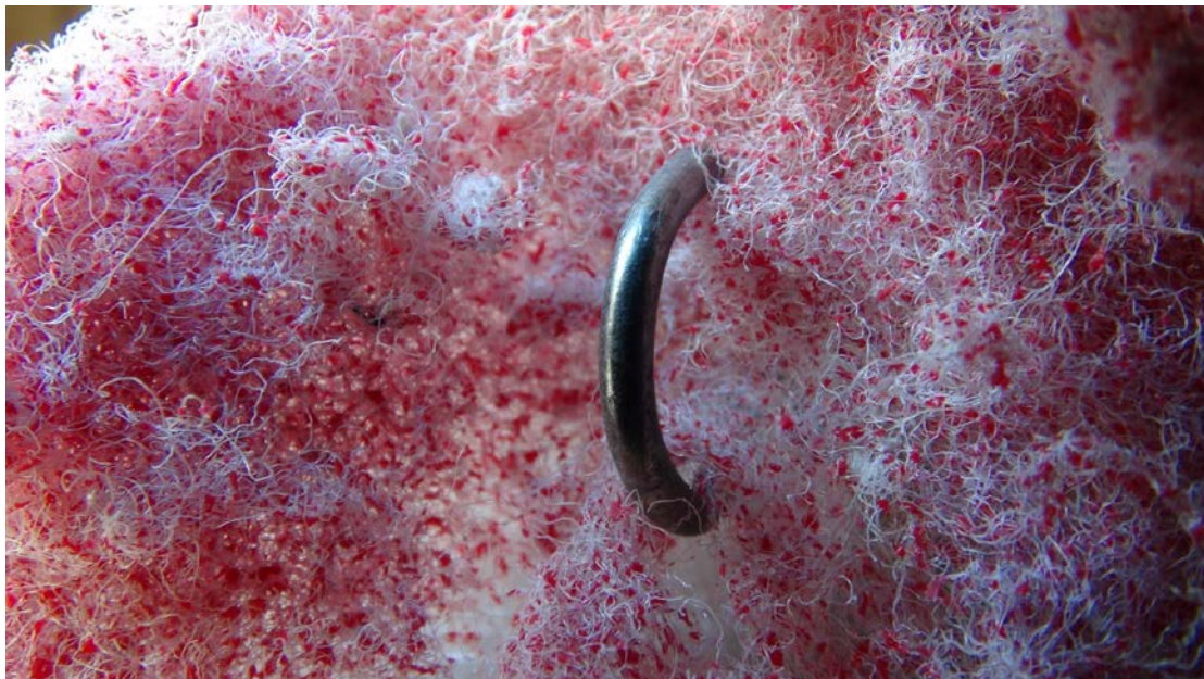
Fig. 2.16: Tension mounts on a mysterious hook as a bag on wheels departs