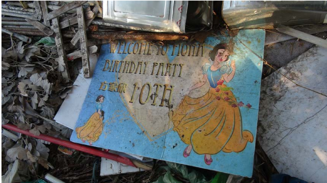
Fig. 2.17: Unidentifiable sound resembles Snow White ruffling her dress

While it was my intention to record an ambient soundscape that embodied Taoist philosophies and Eno's theories concerning the relationship between humans and the landscape, I cannot take credit for or adequately explain the serendipitous alignment of sounds and images manifested by the Tao in Clouds and 4 cigarettes . My interpretive analysis of these spontaneous alignments is merely my own imagination attempting to grasp the "ungraspable Tao" (Tzu, 300 BC/2015, p. 21).