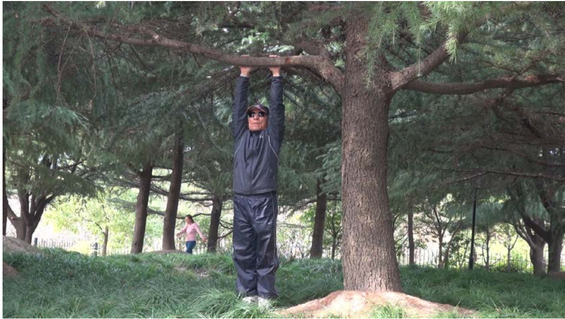
Fig. 2.3: Representation of the Taoist body of the earth

Influenced by Giblett's (2008b) theories concerning the Taoist body of the earth (p. 157) and the concept of the Nejing Tu (Figure 1.1): the lines on the man's tracksuit pants mirror the lines on the tree trunk (Figure 2.3). This opening shot which introduces the viewer to the documentary's subject matter of cultivating the Taoist body was used to provide a visual representation of the core Taoist belief that the human body and the earth are one entity (Giblett, 2008b; Kohn, 2006; Schipper, 1978)