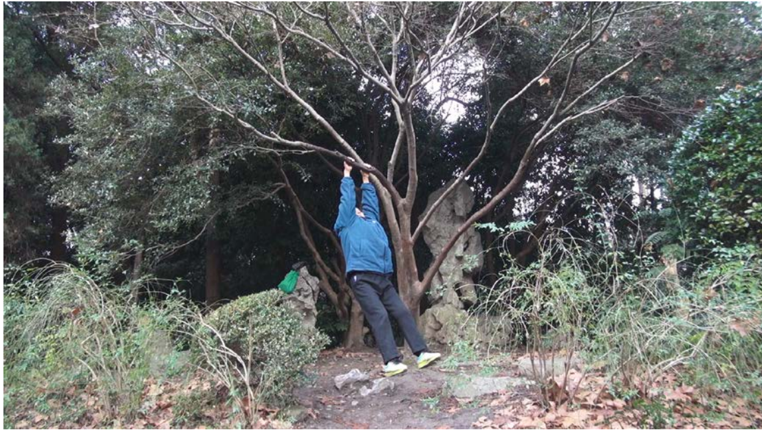
Fig. 2.2: Old lady stretches her muscles on organic exercise equipment

In Fig. 2.1 and Fig. 2.2, I adopted a hybridization of Nichols' (2010) poetic mode (p. 162) and performative mode (p. 199). The poetic element within this hybrid mode was used to show the human forms entwinement with organic and inorganic structures through shape and form (p. 163), while the performative element suggests the inner workings of daily life (p. 201) in post-Mao Shanghai.