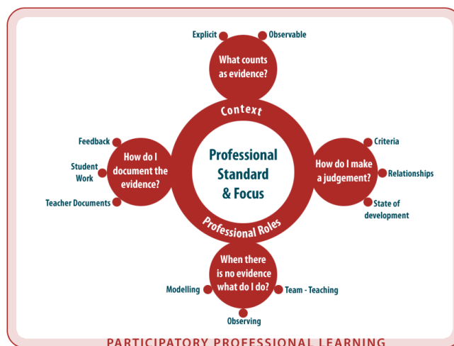
Figure 1: The Participatory Professional Learning Model

The original Project Evidence team conceptualised and developed what they referred to as a Participatory Professional Learning (PPL) model (Figure 1), acknowledging the role of shared learning and joint construction involved in learning what it means to teach within a “collegial learning relationship instead of an expert, hierarchical one-way view” (Le Cornu & Ewing, 2008, p. 1803).