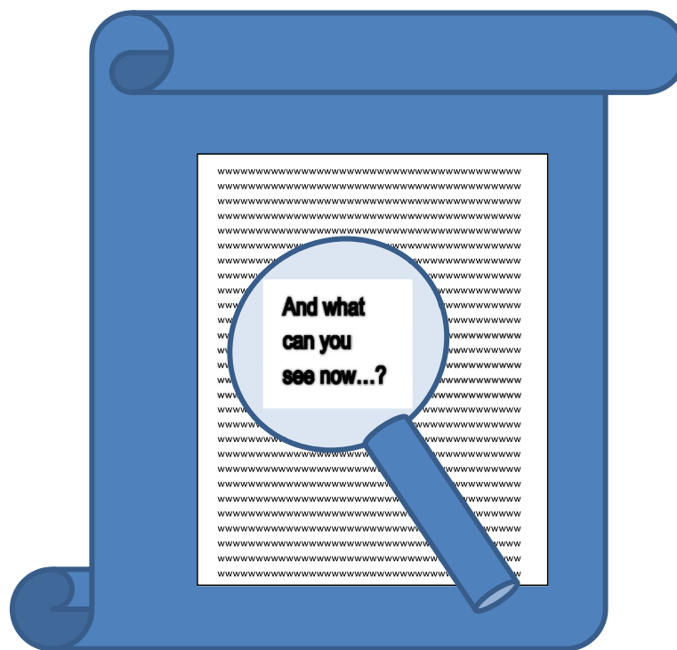
Fig. 1 “Precision” itself does not guarantee for better understanding of an issue. An old wise dictum adopted by all European cultures/languages warns—one cannot see the forest for the trees. Hence, technologically driven higher resolution of individual elements does not automatically mean that you can better recognise the complex problem which you are looking for, particularly when the zoomed element (the tree) is prioritised and/or pulled out from the overall context or zooming itself makes the complete picture (the forest/multifactorial issue) unreadable. Contextually, better understanding of the complexity in medicine is not guaranteed by “precision medicine” itself. Advanced health care demands a close cooperation between all issue-related fields, integration of multidisciplinary knowledge and innovative technologies based on long-term strategies and concepts considering interests of patients, professionals and society at large

Global deficits are well-defined and described elsewhere as unpredictable, unpreventable and impersonal medicine [20, 21]. It is evident that a paradigm shift is needed to move from “reactive” to “predictive, preventive and personalised medicine” as a new philosophy