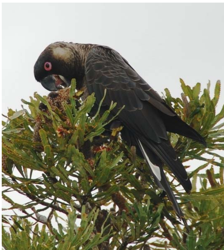
Figure 2. Male Carnaby's Black-Cockatoo feeding on seeds from Banksia attenuata .

Carnaby's Black-Cockatoo have been predominantly observed foraging on the seeds of 52 native species (Table 1). By far the most common native plant species Carnaby's Black-Cockatoo have been observed foraging upon include the Banksia (including Dryandra species), Hakea , Grevillea , Allocasuarina and Eucalyptus (Carnaby 1948; Saunders 1974a, 1974b, 1980; Higgins 1999). On the Swan Coastal Plain, identified important native food plants include Banksia attenuata , B. menziesii , B. grandis , B. ilicifolia , B. sessilis , B. prionotes , Corymbia calophylla and Eucalyptus marginata (Saunders 1980; Shah 2006; Weerheim 2008). Indeed, Banksia species (especially B. attenuata ) contributed nearly 50% of native plant foraging records (Figure 2), with an additional 15% of records from Marri C. calophylla (Shah 2006).