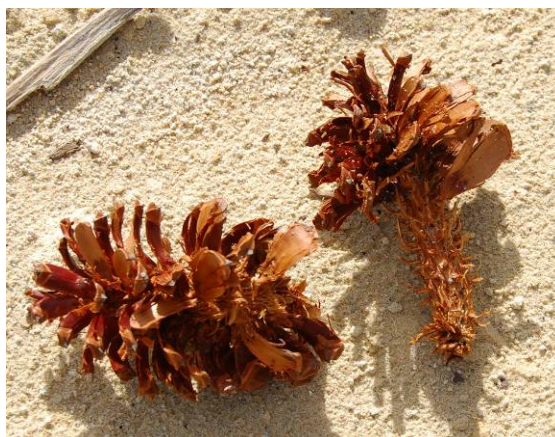
Figure 3: Feeding traces of pine cones discarded from Carnaby's Black-Cockatoos at Gnangara Pine Plantation.

In the mid to late 1960's a study was conducted by the Division of Wildlife Research, CSIRO to examine the extent of damage to pine plantations in a number of plantations around Perth including the Gnangara plantation (Saunders 1974b). This work showed that Carnaby's Black-Cockatoo were most active in the pine plantations in a seasonal manner, typically moving into the Perth metropolitan pine plantations in January, and departing them in April, May or June (depending on the plantation; Saunders 1974b). In the Somerville plantation, the average monthly total of eaten pine cones varied from 2,500 in March to less than 250 in June. While in the Gnangara Plantation, the monthly average of eaten pine cones was greatest in June (> 1000 eaten cones) and lowest in November (< 250). The mid-year increase in activity in the Gnangara Plantation was attributed to additional flocks moving to Gnangara after stripping the plantation closer to the city (e.g. Somerville; Saunders 1974b). In addition, this study also recorded a higher number of eaten pine cones in areas with trees of 16 – 20 years, possibly because there are more of them than the older trees which have undergone thinning and trimming, producing less cones (Saunders 1974b).