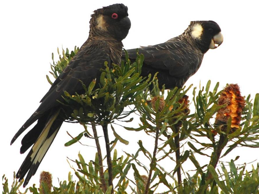
Figure 1. Carnaby's Black-Cockatoo ( Calyptorhynchus latirostris ) on Banksia attenuata . Male on left – note pink-red eye-ring, dark bill and off-white cheek patch. Female on right – note dark eye-ring, pale bill and distinct white cheek patch.