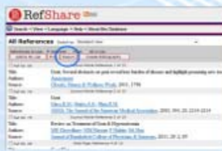
Export to RefWorks from a shared folder