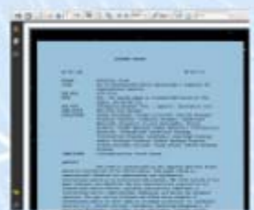
Import using PDF metadata