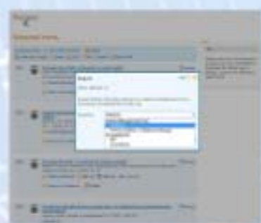
Automatic export from library databases, Library One Search or Google Scholar