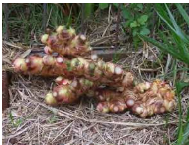
Fig. 1. Fresh rhizome

The ginger rhizome is a spreading bulbous, stem that develops horizontally close to the soil surface. It forms regularly spaced buds that grow to either shoots or new rhizomes. The rounded fresh buds are about the size of a knuckle, and coloured soft lemon-green, with a fleck of pink. A freshly prepared rhizome reflects these colours in Fig 1.