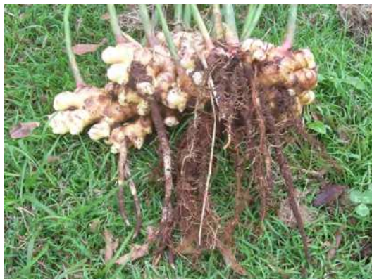
Fig. 3. Ginger roots

Long tap roots grow from the seams of the lower buds and anchor the plant deep in the earth. These tap roots reach to about 80cm and are milky-white, strong and juicy; tasting rather like ginger radishes. The tap roots have few hairs and no lateral shoots. Thin, short fibrous roots also grow from the seams of the fresh buds and these are coated in loose soil and minute micro-organisms.