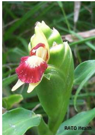
Fig. 5. Ginger flower

Ginger has specific features that relate to its selection in the therapeutic treatment of osteoarthritis. The ginger plant is robust, upright and balanced, with strong life giving forces of warmth and energy focused in the swollen stem base or rhizome. Ginger is a unique plant that stores all its reproductive, nourishing and medicinal forces in a rhizome, with the flowers and seeds being inconspicuous and often absent. Both Eastern and Western alternative medical approaches utilise the heat and vitality of the ginger rhizome in managing osteoarthritis symptoms.