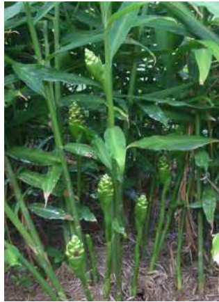
Fig. 4. Ginger flower cones

Ginger has specific features that relate to its selection in the therapeutic treatment of osteoarthritis. The ginger plant is robust, upright and balanced, with strong life giving forces of warmth and energy focused in the swollen stem base or rhizome. Ginger is a unique plant that stores all its reproductive, nourishing and medicinal forces in a rhizome, with the flowers and seeds being inconspicuous and often absent. Both Eastern and Western alternative medical approaches utilise the heat and vitality of the ginger rhizome in managing osteoarthritis symptoms.