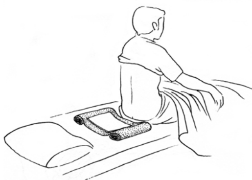
Fig. 6. Ginger kidney compress (Fingado, 2001)

European Anthroposophic hospitals report external ginger applications are effective for chest, metabolic, arthritic and psychiatric conditions, especially when applied to the kidney region (Schurholz, Vogeles et al., 1992/2002). Ginger applications to the kidney region in the form of ginger compresses are found to warm and reactivate the metabolic forces of the body, which has a corresponding positive effect on the will to be active and mobile. The external application of ginger to the kidney region combines both heat and relaxation therapy and is found especially effective for people with osteoarthritis (Therkleson, 2010; 2004).