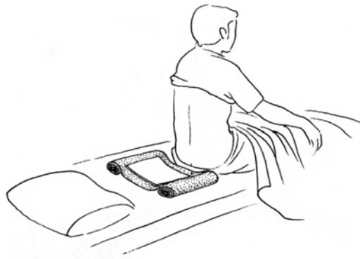
Fig. 6. Ginger kidney compress (Fingado, 2001)

European Anthroposophic hospitals report external ginger applications are effective for chest, metabolic, arthritic and psychiatric conditions, especially when applied to the kidney region (Schurholz, Vogeles et al., 1992/2002). Ginger applications to the kidney region in the form of ginger compresses are found to warm and reactivate the metabolic forces of the body, which has a corresponding positive effect on the will to be active and mobile. The external application of ginger to the kidney region combines both heat and relaxation therapy and is found especially effective for people with osteoarthritis (Therkleson, 2010; 2004).