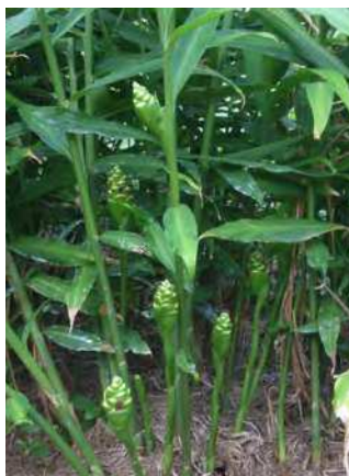
Fig. 4. Ginger flower cones

Ginger has specific features that relate to its selection in the therapeutic treatment of osteoarthritis. The ginger plant is robust, upright and balanced, with strong life giving forces of warmth and energy focused in the swollen stem base or rhizome. Ginger is a unique plant that stores all its reproductive, nourishing and medicinal forces in a rhizome, with the flowers and seeds being inconspicuous and often absent. Both Eastern and Western alternative medical approaches utilise the heat and vitality of the ginger rhizome in managing osteoarthritis symptoms.