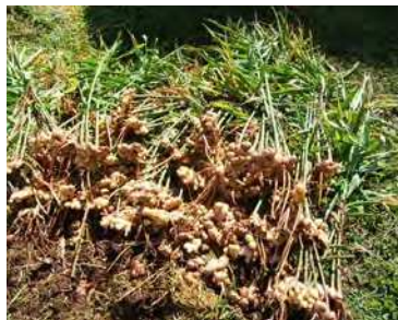
Fig. 2. Ginger harvest

The ginger rhizome has a pungent aroma, smelling fresh and sweet, and tastes hot, with a sharp and awakening effect. The rhizomes are harvested, when the leaves start to dry and contract in the winter period as shown in Fig 2. It is the rhizome that concentrates ginger's nourishing, healing and reproductive qualities. Ginger is propagated in spring from stored rhizome stock of the previous year.