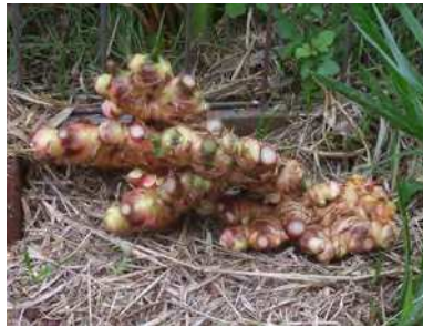
Fig. 1. Fresh rhizome

The ginger rhizome is a spreading bulbous, stem that develops horizontally close to the soil surface. It forms regularly spaced buds that grow to either shoots or new rhizomes. The rounded fresh buds are about the size of a knuckle, and coloured soft lemon-green, with a fleck of pink. A freshly prepared rhizome reflects these colours in Fig 1.