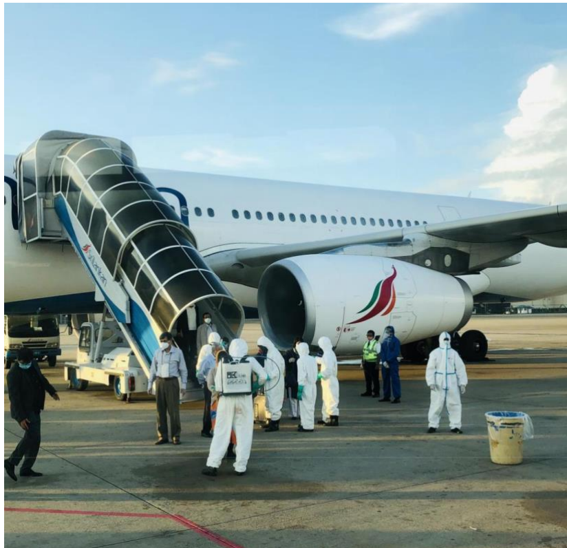
Figure 4: Passengers during their transit at Bandaranaike International Airport, Colombo (photo by author, 9 May 2020)