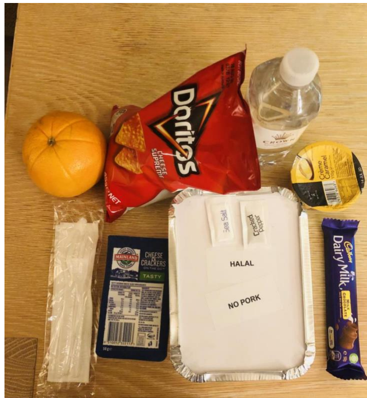
Figure 8: One evening main meal was baked fish and potatoes (photo by author, 15 May 2020)