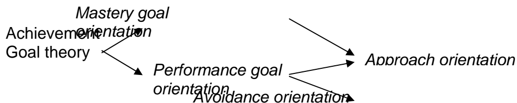
Chart 2 Components of achievement goal theory

Self-worth theory of achievement motivation states that in certain situations some self-worth protecting students stand to gain by not trying --- deliberately withdrawing effort (Thompson et al., 1995) to protect their sense of self-worth. This theory can help teachers understand how to motivate students to learn by using "appropriately challenging" (Dolezal et al, 2003:243) tasks---and ensuring that the tasks are not too difficult.