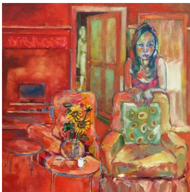
Interview Visualisation #4: Domicile (2020)