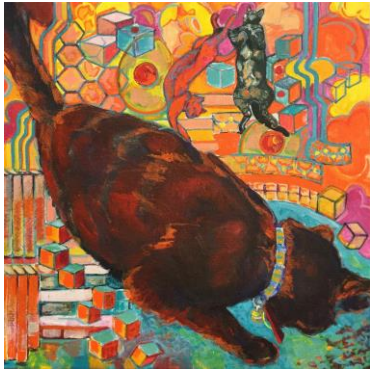
Visualisation #2: Move One Thing – Things Move (2020)

“I’m actually thinking of moving. Sorting out my study, clearing clutter from my studio, has given me a push.” The second work in this series reflects a “domino” experience; the act of tidying her studio prompted this participant to think about moving house. Here, the cat acts as a metaphor for the phenomenon of “change” itself – the smallest shift engenders a response; change affords further change. Possessions piled high teeter as “change” waits, poised to respond if anything moves – and move it does! The process of packing up her studio triggered a bigger move – the move to a new home.