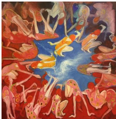
Visualisation #1: Making Space (2020)