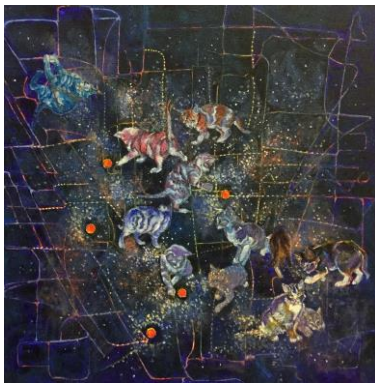
Visualisation #3: Chilling with Cats and Driving in Cars (2020)

“I’m spending quite a bit of time driving. I need to be contactable... I need to use my phone ... just for texts.” The 3rd interview visualisation in this set represents the tension between the demands that others made on Participant B during her DS and her aspiration to stay at home offline. Despite her desire to use her day offline to be more creative, she felt she needed to communicate with family via text. This image overlays two “experiential universes” as desire (to “chill out” at home) and commitment (endlessly driving family around) intersected. A metaphorical black hole begins to open, and the reclaimed DS time is sucked into the void.