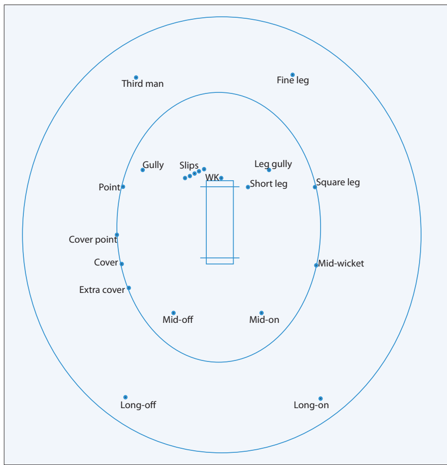
Fig. 2. Pitch map showing the different fielding categories. (WK = wicket keeper.)

and required practically no diving or lateral movements. This finding is not consistent with conventional wisdom.