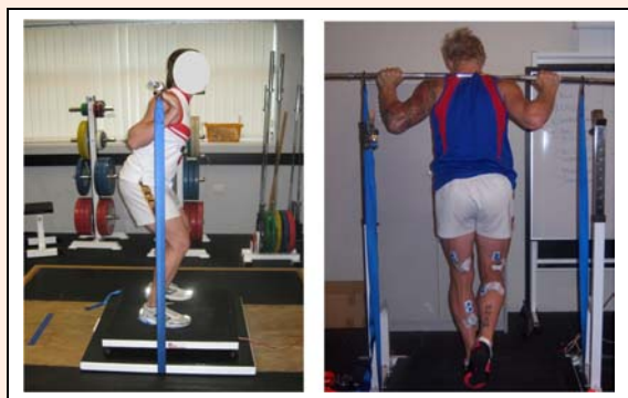
Figure 1. Subject positioning for bilateral and unilateral isometric strength tests.

Athletes were provided with sub-maximal familiarisation (10 minutes duration interspersed with recovery) of all three trial types [Bilateral, BL; Unilateral (Kicking), KL; Unilateral (Support), SL], prior to performing a total of nine lower body maximal isometric contractions: three bilateral and six unilateral (kicking and support limb) trials. All subjects identified their right leg as the kicking limb and left leg as the support limb. The order of testing was randomised and counterbalanced to negate the effects of muscular potentiation or fatigue (Rassier and MacIntosh, 2000). Subjects maintained maximal contractions for a period of five seconds, and were provided with two minutes passive recovery between each maximal effort. The investigator, and two research assistants provided verbal encouragement, and visually monitored athlete technique during each trial to ensure postural and mechanical compensatory adjustments did not occur; and ensured athlete safety was maintained.