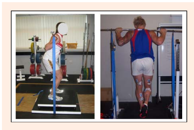
Figure 1. Subject positioning for bilateral and unilateral isometric strength tests.

Athletes were provided with sub-maximal familiarisation (10 minutes duration interspersed with recovery) of all three trial types [Bilateral, BL; Unilateral (Kicking), KL; Unilateral (Support), SL], prior to performing a total of nine lower body maximal isometric contractions: three bilateral and six unilateral (kicking and support limb) trials. All subjects identified their right leg as the kicking limb and left leg as the support limb. The order of testing was randomised and counterbalanced to negate the effects of muscular potentiation or fatigue (Rassier and MacIntosh, 2000). Subjects maintained maximal contractions for a period of five seconds, and were provided with two minutes passive recovery between each maximal effort. The investigator, and two research assistants provided verbal encouragement, and visually monitored athlete technique during each trial to ensure postural and mechanical compensatory adjustments did not occur; and ensured athlete safety was maintained.