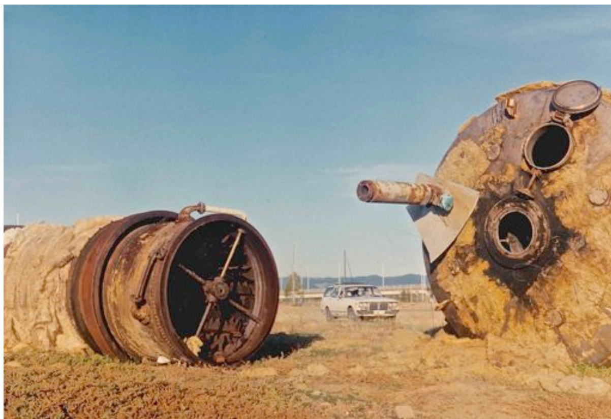
Figure 3 Rusty hoppers left on Lartelare's site after the demolition of the CSR Refinery. Schultz made recordings in and around the hoppers.

The following track, "Ground Water, Sea Water," depicts the swirling fluvial debris of a century of construction and deconstruction. One is riveted to sit still and listen.