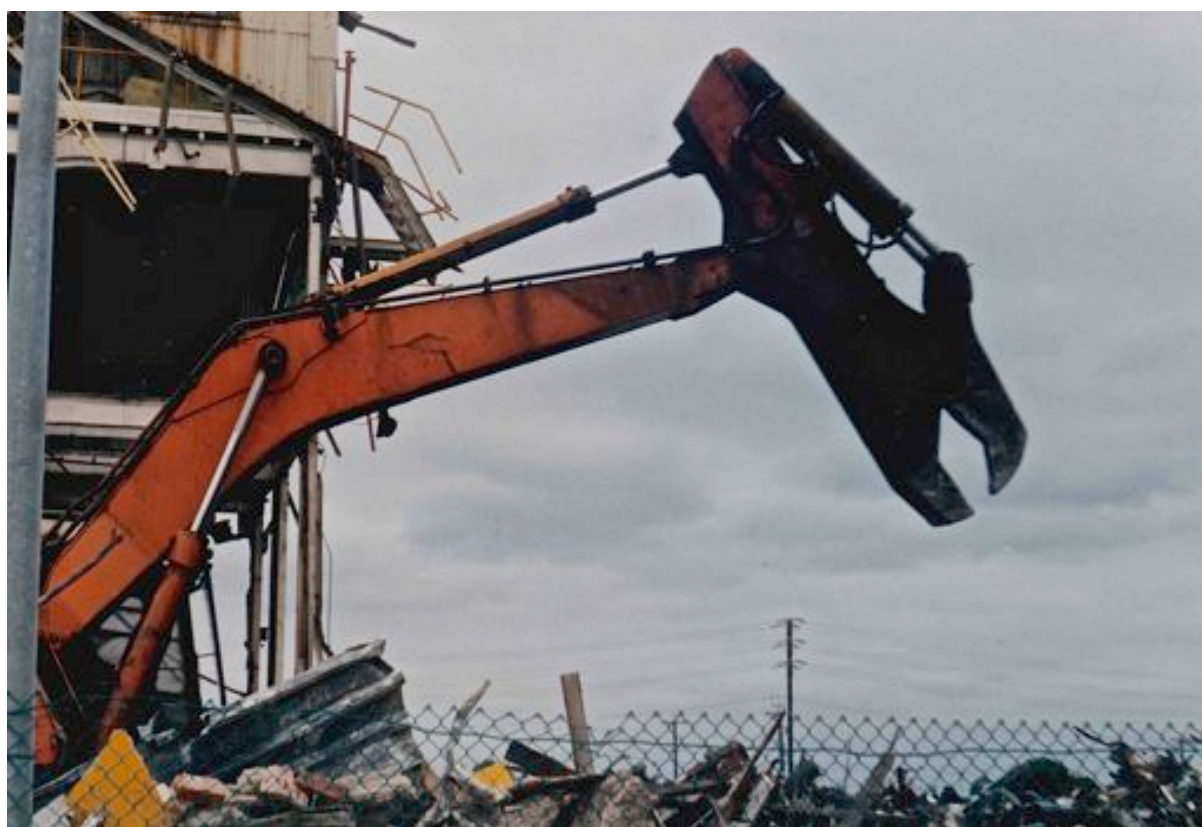
Figure 2 One of the huge machines of demolition at the CSR Sugar Refinery at Glanville, January 1993. CD booklet image, courtesy Chester Schultz.

“Islands of Quietness,” to revisit my epigram—are “rarely included in the equations of urban developers.” “The Beasts of Babylon” (Track 11) references the “ruined City,” a spiritual metaphor from The Revelation of John: “Babylon the Great is fallen.” 76 This recurring motif in Schultz’s work is generally inclusive of people who live on a city’s margins. However Within Our Reach extends the metaphor to the natural environment on the margins including the arboreal habitats of sparrows and pigeons destroyed in the ensuing acoustic disaster. Schultz was quick to photograph and record the overbearingly loud, clanking cranes and other hard-shelled industrial machines (Figures 2 and 3) that demolished the Sugar Refinery in January 1993, following on from its closure in 1991. Track 11 graphically depicts one “beaked monster” grabbing huge scraps of metal while a sewage pipe pisses 37 million litres of effluent (daily) into the river at the Causeway where the Reach was “beheaded.”