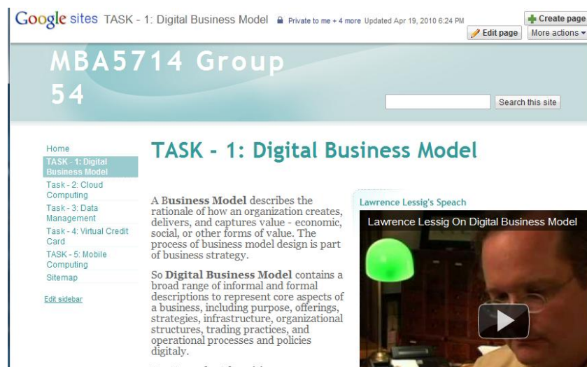
Figure 2: Google Sites Example for a Student Group

Figure 2 shows the Google Sites interface for one of the groups. At the bottom of each page in the wikis, comments and file attachments can be added.