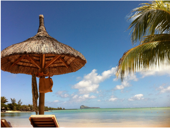
Photo: Tourism activities as potential interventions for SHS individuals.

Amid increasing societal health concerns, especially as countries host larger ageing populations, the nexus between individuals' health and tourism has been paid careful attention to in many disciplines. Tourism and hospitality represents one of the industries most affected by COVID-19 due to travel restrictions and social safety measures [17]. Interestingly, however, tourism's role in public health has been largely neglected, despite documented benefits [18]. For instance, taking part in vacation activities has been shown to boost travellers' physical and psychological well-being [19]. Leisure activities can also improve senior travellers' well-being. The integration of physical and mental health has changed views on health promotion and disease prevention [20]. Well-being features pleasant moods, productivity, a lack of negative emotions, and a sense of fulfilment. Scholars have examined related aspects such as economic, emotional, physical, psychological, social, and workplace well-being, and life satisfaction. Yet despite SHS having become