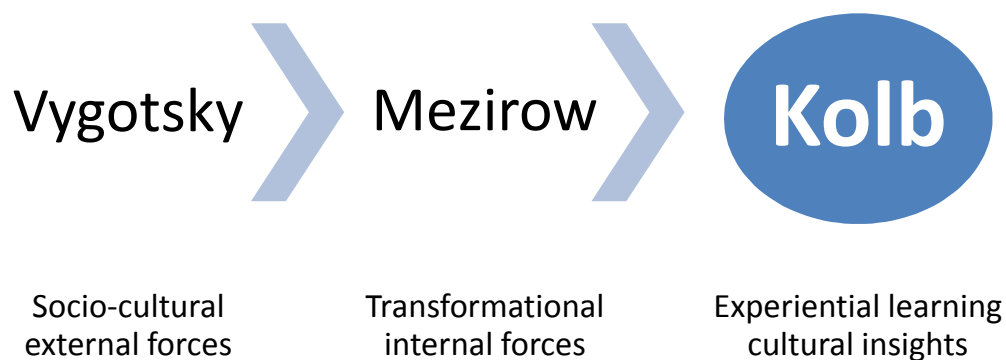
Figure 1: Theoretical Foundation for Study Design

Professional learning requires the complex task of transforming acquired knowledge into applied knowledge. To better understand how the participants in this study were making this transformation a theoretical model of learning was developed to better understand the cross-cultural experience. As shown in Figure 1, the model drew upon the experiential learning theory (ELT) (Kolb, 1984) and was supported by the foundational work of Mezirow (1981, 1991, 1994) and Vygotsky (1930-1934/1978).