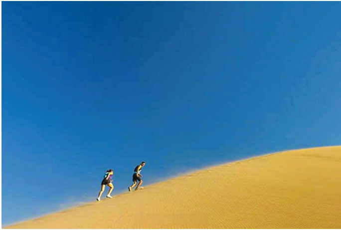
Photo: Success lies in persistence.

protective conditions, Ross suffered from cholera and malaria successively, almost losing his life. Stimulated by his original intentions, Ross studied dozens of hypotheses by dissecting hundreds of species of mosquitoes and examining every mosquito tissue, but found no compelling proof. Ross realized that dissecting mosquitoes in water or a weak salt solution left him less time for methodical staining. He then tried to dissect the mosquitoes in a concentrated salt solution and discovered the presence of spores. Through extensive observation, Ross found that the spores in the mosquito's body were attached to a duct and encapsulated to form a part of the salivary glands, which injected saliva into the blood when the mosquito bites the skin. The discovery of malaria vectors shattered the entrenched miasma theory. Malaria, which once rendered humans helpless, finally turned out to be a preventable and controllable disease.