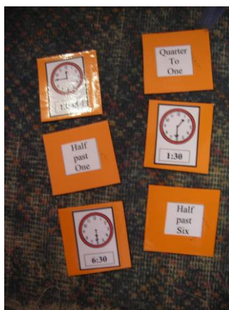
Figure 2. Esther's cards used for matching analogue and digital time

Esther also listed four rotational tasks she had chosen for the students to complete. When planning the lesson Esther chose activities related to her topic, providing evidence of making connections . She also considered the materials she would use to help the students learn, for example she had laminated cards with clock faces, digital times and clock times (Figure 2). This was evidence of transformation by representing the mathematics to the students.