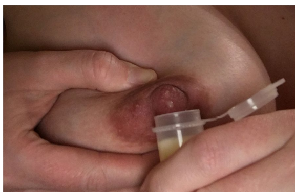
Fig. 3 Example of antenatal milk expression and milk collection technique taught as part of the AME educational intervention. Note that photo is from the first author's own photo collection. The person expressing is not a participant in the current trial

At the subsequent three study visits during the 38th, 39th, and 40th week of pregnancy, participants meet with a Pacify Health IBCLC and study personnel to practice AME for a maximum of 10 minutes and receive reinforcement and feedback on their technique. At each visit, instructions for milk collection, storage, and transport to the birth center are reviewed, as well as indications for discontinuing AME (vaginal bleeding; regular/frequent labor contractions, reduction in fetal movement, development of exclusion criteria). While participants are encouraged to practice AME on camera to receive feedback from the IBCLC, for participants uncomfortable with breast exposure, study staff suggest turning off the camera or pointing the camera away from their breasts while the IBCLC attempts to have the participant describe what they are seeing and feeling to provide feedback.