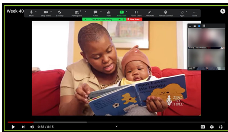
Fig. 4 Screenshot from a video visit with a control group participant in the 40th week of pregnancy. Video featured addresses infant language and literacy development