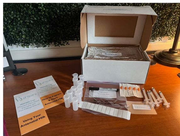
Fig. 1 Antenatal milk collection kit. Kit includes milk cooler, milk collection containers (flip-tops and 3 mL syringes with caps; 1 mL and 5 mL syringe sizes not available at time of photo), plastic bag for milk containers at time of transfer to cooler (with sticker to note time of milk removal from home freezer), labeling tape, waterproof marker, study luggage tag, and brochures/instructions on antenatal milk expression and collection and use of antenatal milk

Participants are taught the milk expression technique during the 37-week Zoom visit after first viewing two introductory videos demonstrating the technique. The