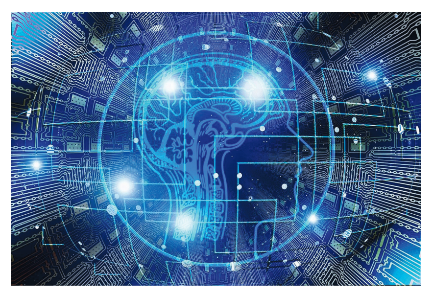
Figure 1. Artificial Intelligence, Brain.

Various replacement or augmentation devices for organs, such as the eyes, kidneys, heart, muscle, liver, skin, and brain, have been developed due to the creation of implantable artificial organs [4]. Artificial organs can be developed from a number of substances, such as polymers and biological tissues, and are intended to mimic the shape and functionality of actual organs [19]. For instance, the Wearable Artificial Kidney (WAK)