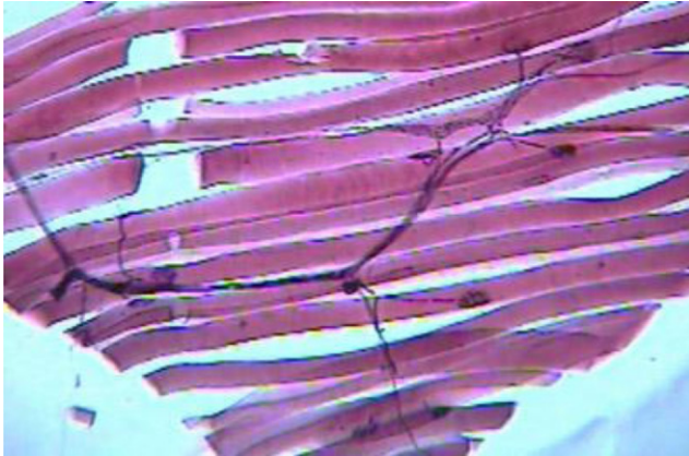
Fig. 1. Muscle innervation. An illustration of a normal motor unit showing axons leading to motor end plates (neuromuscular junctions) on muscle cells. (Taken from http://www.biology.iastate.edu/Courses/212L/New%20Site/31%20Muscle%20&%20Skeletal%20systems/muscle%20skeletal%20index.htm ). Photos and layout by Linda Westgate, Warren Dolphin, and Mark A. Mangum.

was well underway by 100 days. Microglial and astrocytic activation around motoneurons was not identified until after the onset of distal axon degeneration. Thus, in this animal model of human ALS, motoneuron pathology begins at the distal axon and proceeds in a “dying back” pattern. This is supported by the denervation and reinnervation changes in muscle but normal-appearing distal motoneurons following autopsy of a reported ALS patient (Fischer et al., 2004).