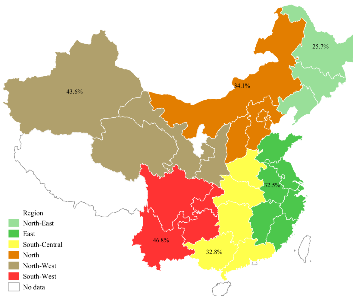
Figure 1. The age-adjusted somatic-mental multimorbidity (SMM) prevalence by geographic location in China, 2013.