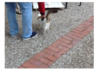
Figure 3: People petting cats.