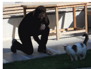
Figure 2: People feeding cats.

Our observations show that 4 of 12 people paid attention for feeding, petting and playing with them. During the observation, it was seen that if one of the people around the area start to interact with cats, other people want to attend this interaction. However, the number of people interacting is not high. Despite the number of cats, there were few people who interact with cats. 1 of 4 fed the cats by their hands (Figure 2), 2 of 4 only petted the cats (Figure 3) and the last person played with them (Figure 4).