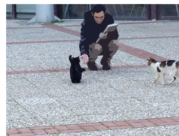
Figure 4: People playing with cats.

The observation also documented that most people were afraid of touching and interacting with cats. We believe that these numbers should be increased. Since working life is a stressful for instructors and course load for students, encouraging the interaction between human and cats might be an alternative solution to minimize their stress level and enhance their efficiency in their work and duties.