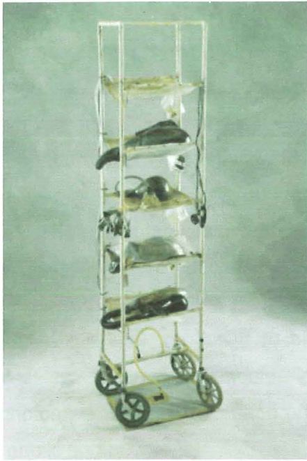
Figure 6: Walter Zimmerman. RSCD/4U . Hand blown glass and mixed media. 1999