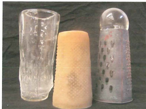
Figure 5: Untitled , 2004. Blown glass, metal, wax.

Once found, these objects may become part of a work. They may be manipulated in some way, dismantled, recreated in several new materials therefore taking on new associations and lives. The item may become a mould to create a new object or process.