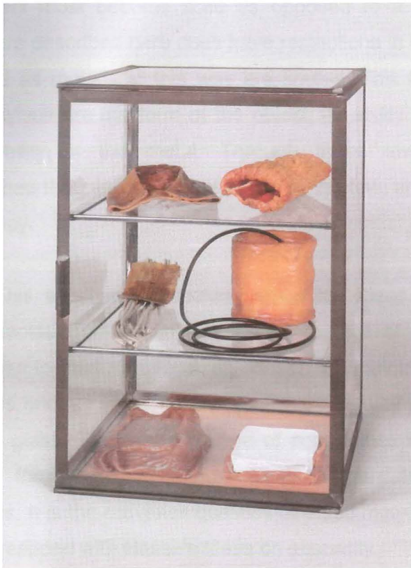
Figure 16: Eva Hesse, Untitled , 1967-68. Mixed media in a glass and metal case. (37.1x26x26cm)