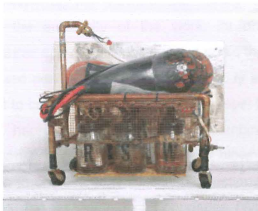
Figure 8: Walter Zimmerman. Urban Unit #3 (Red) . Hand blown glass and mixed media, 1999