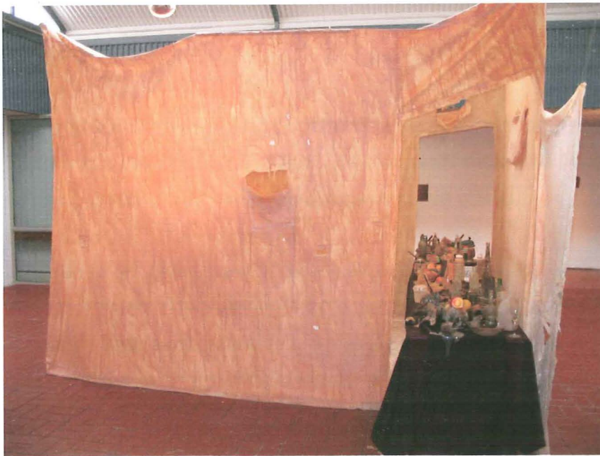
Figure 17: When I grow up... 2004. Latex and mixed media installation.