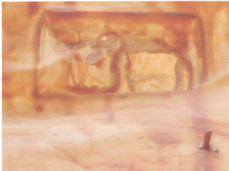
Figure 18: When I grow up... 2004. (Detail)

"Those 'Dust breedings' and "standard stoppages' open the door for us to the astonishing poetry of nothingness, to the sense of the senseless, and to a world hidden in the microcosm of every object" (Sanouillet, (1975) p. 11)