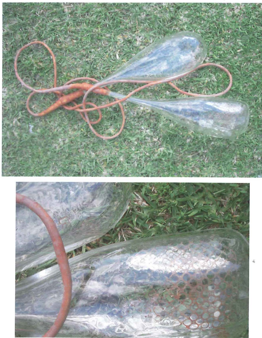
Figure 10: Photo Documentation. Untitled , 2004.

bandage wrapped cord that is coated in latex. Latex has immediate links to skin in its colour, properties and the way it ages, eventually becoming brittle and disintegrating. These blown glass forms that bear the marks of a cheese grater appear to be joined by a brown 'umbilical cord' that references the idea of the domestic as the realm of the mother. The piece also acts as a skipping rope extending the feminine connotations and yet again speaking of history and memory.