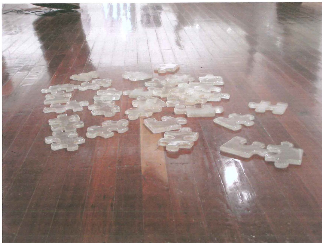
Figure 1: Untitled (glass jigsaw puzzle), 2004. Dimensions variable.