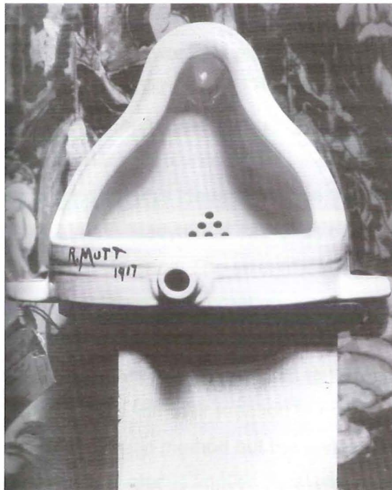
Figure 19: Marcel Duchamp, Fountain 1917.

The ready-made can perhaps be best described as an object in the material, external world, most often a manufactured object, which the artist by virtue of the attention he turns upon it elevates to the symbolic status of a work of art. Its selection is obviously not a random affair and Duchamp has described his coming together with these objects as a 'kind of rendezvous'. Duchamp realised that for the ready-made to retain its power to force upon the recipient or viewer a reappraisal of intellectual and aesthetic values it must retain a quality of rarity and he deliberately limited his output. (Golding, (1973) p, 55.)