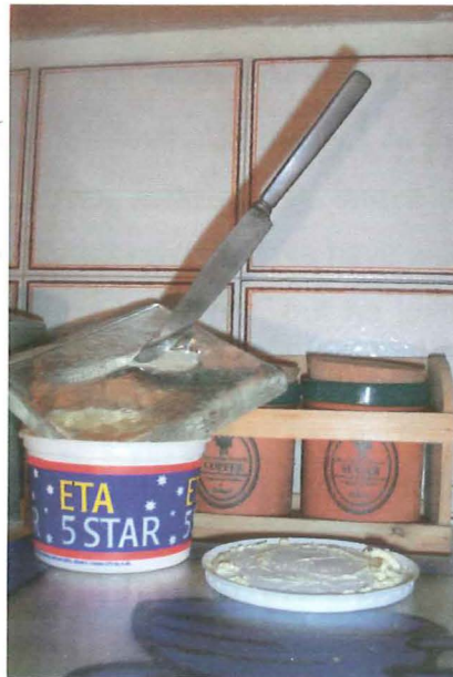
Figure 20: Breakfast 2004 . Glass and found object.

The combination of these materials in this manner is non traditional therefore this process has quite a degree of chance to it. The glass carries associations of preservation and trophy like connotations and the item now embedded in its new home appears as an ornament that should adorn the top shelf, though the object, an old iron is identifiable. The function of it is removed and it is both funny and absurd in its new state.