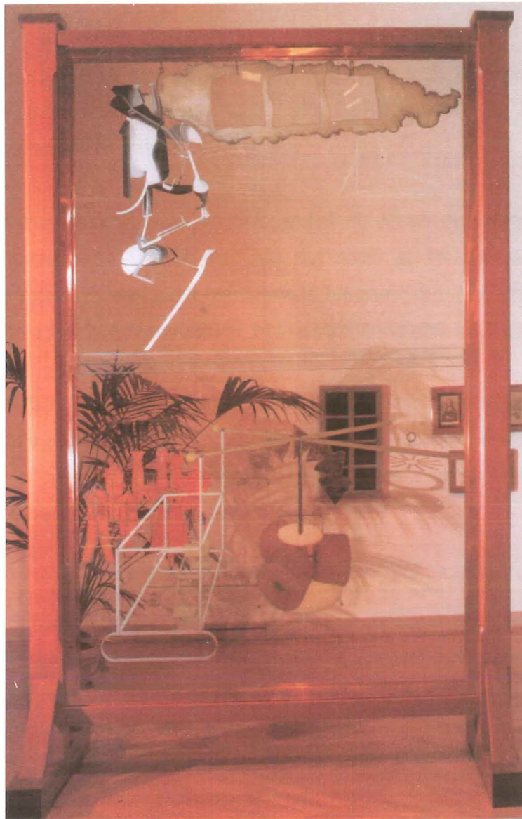
Figure13: Marcel Duchamp, The Bride Stripped Bare by Her Bachelors, Even (The Large Glass) 1961/1986 (reconstruction).