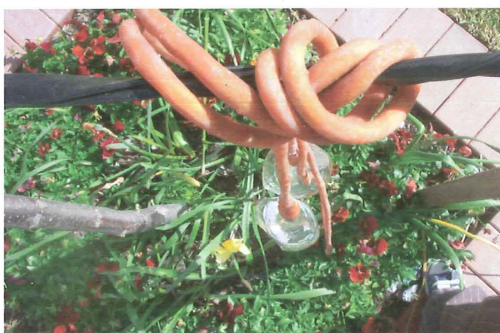
Figure 11: Photo Documentation. Untitled , 2004.

By combining glass and latex the relationship between the blown objects has successfully captured the ideas and concerns relating to trace, childhood and domesticity but ambiguity and an element of humour is present allowing for possibilities and the viewer to bring potential to the work.