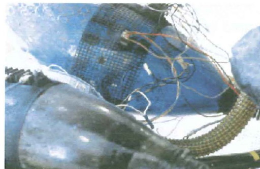
Figure 9: Walter Zimmerman. Safety Yellow (detail). Hand blown glass and mixed media, 1996