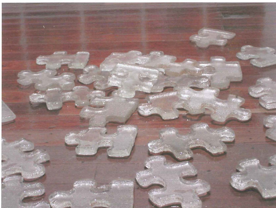
Figure 2: Untitled (glass jigsaw puzzle), 2004. Detail.