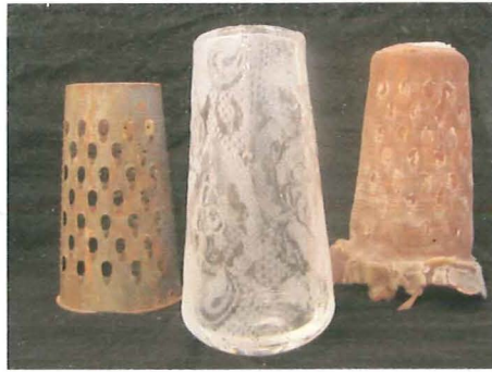
Untitled , 2004. Sandblasted glass, latex, metal.

Though Duchamp painted the panels of Large Glass the ability for the viewer to see through the work and incorporate the details of the surroundings in the image is an integral aspect of the work. This concept is important to my glasswork also. Duchamp's use of such a material in this manner could be attributed to his reaction to the 'physical' side of painting. By using glass the traditionally private, pictorial space of the painting was denied.