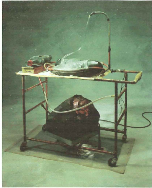
Figure 7: Walter Zimmerman. Unidentified . Hand blown glass and mixed media 1995