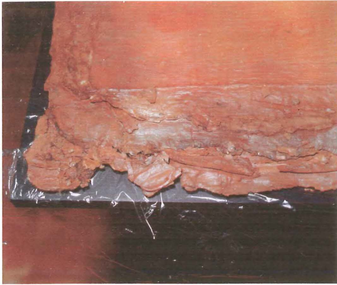
Figure 15: Eva Hesse, Augment , 1968 (detail). Latex and filler over canvas.