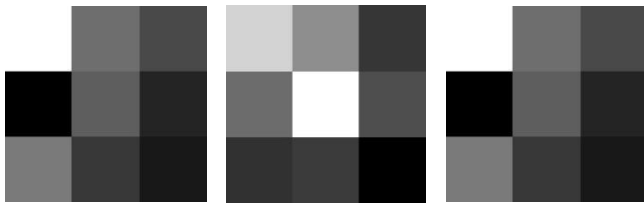
Fig. 1. Image blocks in ex.2 & ex.3. Left: original image f(x,y) . Middle: blurred g(x,y) . Right: estimated image \hat{f}(x,y)